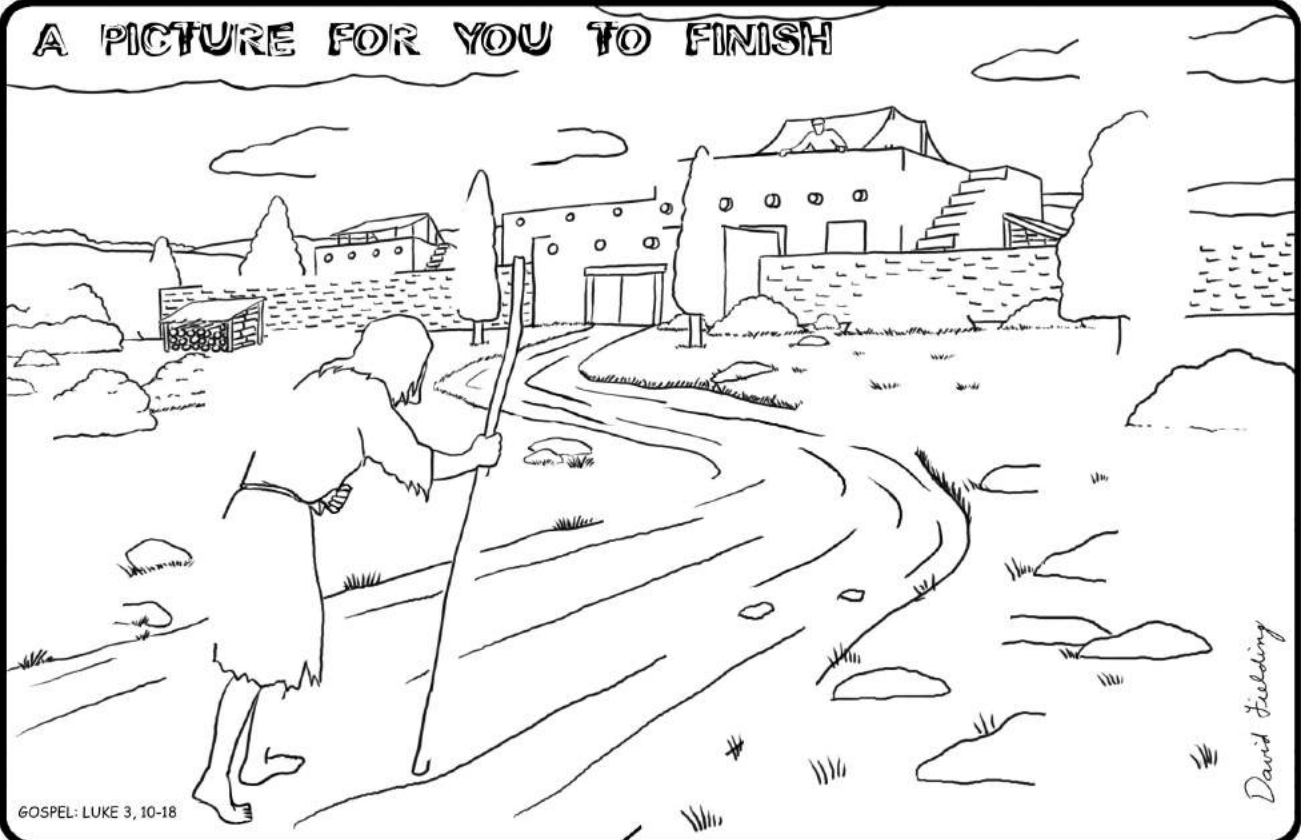
GOSPEL: LUKE 3, 10-18